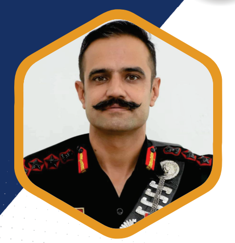
COL. SURENDER BRAR INDIAN ARMY GHPS ALUMNUS - 1997