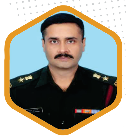
LT. COL. ANUJ AGGARWAL INDIAN ARMY GHPS ALUMNUS - 2000