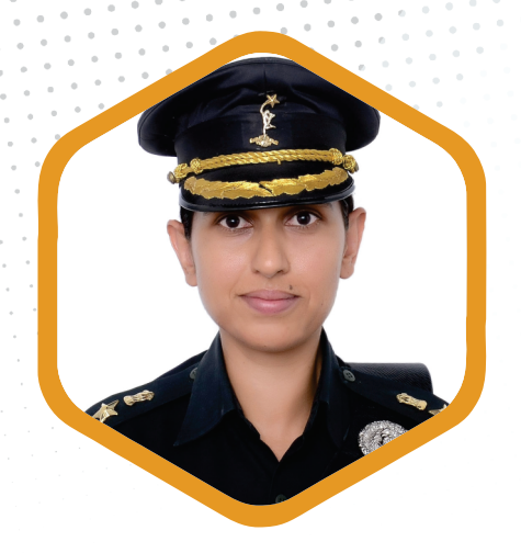
INDIAN ARMY GHPS ALUMNUS - 2000

S M T W T F S S M T W T F S S M T W T F S S M T W T F S 12 13 14 15 16 17 18 19 20 21 22 23 24 25