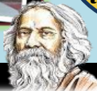
Rabindranath Tagore Jayanti

Buddha Purnima commemorates and celebrates the birth and enlightenment of Lord Buddha. A special assembly was organised on the occasion of Buddha Purnima. The students chanted the famous 'Buddha mantra... Buddha Hai...' and had a meditation session. It was followed by a talk about the life of Buddha, a Podarite, who chose the path of wisdom and enlightenment.